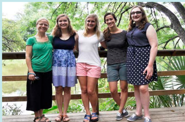
Posada Esperanza Staff 2013-2014