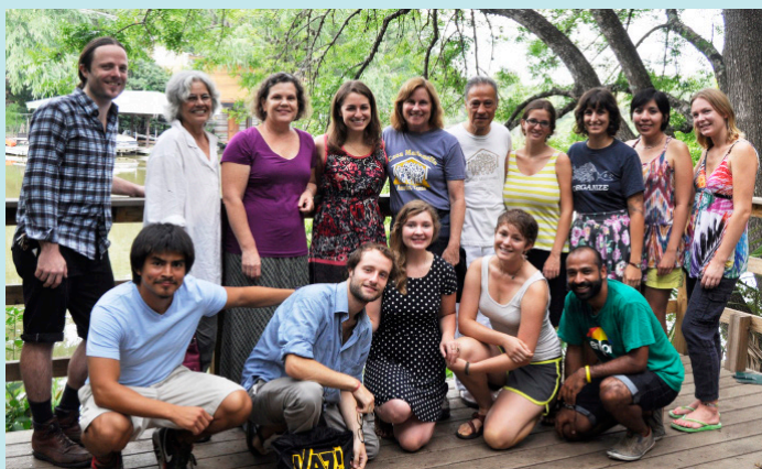
Casa Marianella Staff 2013-2014