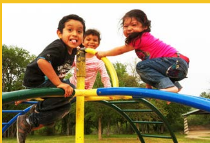
Posada kids playing on the playground

A broad and beautiful community of support has helped Posada Esperanza to grow and today this dynamic and generous community helps care for the families and lift them up toward their goals. We started Posada Esperanza with a couple of dozen community volunteers and now nearly 200 community volunteers provide over 1,000 hours of service each year. We are able to serve the individual needs of our guests because the community has grown their efforts and generosity as we have grown our capacity for families. Every hour of effort and every dollar donated makes a difference in the lives of women and children who are striving to reach their dreams. Thank you to all of you for being a part of Posada Esperanza's 10 years of service to families.