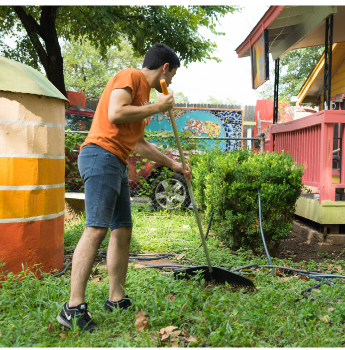
- CLARE DECK