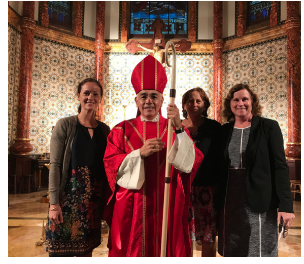
Casa Marianella's legal clinic is this year's recipient of the Virtus in Lege award from the Catholic Diocese of Austin, which was awarded during the Red Mass Celebration.

Casa Marianella's legal clinic, Casa Marianella Immigration Legal Services (CMILS), exists to provide free immigration legal services to residents, ex-residents, and community members living under the poverty line. We have assisted many individuals with a variety of matters, including U visas, T visas, Special Immigrant Juvenile petitions, Asylum, Withholding and Convention Against Torture, Deferred Action for Childhood Arrivals (DACA), family petitions, applications for green cards, naturalization, and applications for work permits. This past year, CMILS has been busy putting on free citizenship clinics to help eligible individuals prepare their naturalization applications at no cost; to organize general immigration clinics with Know Your Rights presentations and free attorney consultations; and to assist DACA recipients to renew their applications in free group settings. We are excited to continue our work helping some of our most vulnerable Texans. CMILS would like to say a special thank you to all of our wonderful donors! We could not do our legal work on behalf of Casa residents and the immigrant community without you.